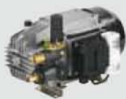
Mod. 757 (HPV)