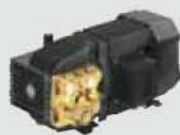
Mod. 767 (HPE)